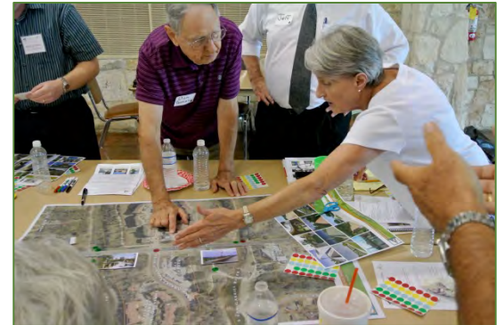
Austin Ave. Public Workshop

The City of Georgetown hosted the second public meeting for the Austin Avenue Bridges Project in a workshop format. The purpose of this meeting was to develop a vision for the future of the bridges that balances its needs and the wants of the community. A walking tour of the project was conducted prior to the meeting for interested attendees. At the workshop, the project team provided a brief presentation and then community members participated in a workshop to share input on the project. The team did collect RSVPs for the workshop and walking tour to help prepare for activities.