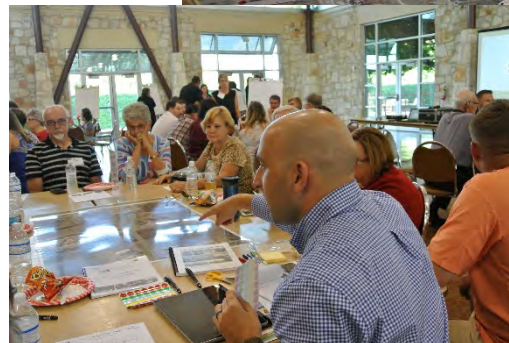
Austin Ave Public Workshop