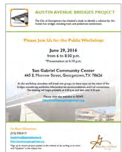
Austin Ave. Public Workshop Flyer

The meeting was also promoted by Georgetown Online through emails sent to contacts in their database.