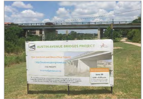
Austin Ave. Meeting Notification – San Gabriel Trail

The City also utilized digital message boards the week of June 25 th along Austin Ave., alerting north and southbound traffic to the public meeting.