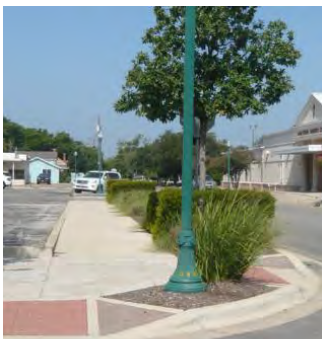
Sidewalks leading to the bridges are currently Level 3