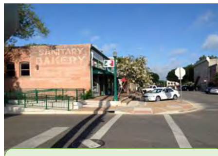
Type C intersections include a striped crosswalk