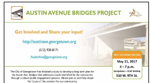
Signage placed at the north and south ends of the San Gabriel Trail

On April 5, 2017, city staff also attended The Downtown Lowdown, a quarterly informal community meeting regarding activities in Georgetown's downtown district, to share updated project information with interested Georgetown residents.