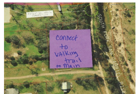
Mapped Comment on Alternative 2a

There were 13 written comments collected through comment cards at the public meeting, 64 comments submitted through the online comment form and 29 additional comments received via email. One written comment was submitted regarding Section 106 of the National Historic Preservation Act and one emailed comment included the results of a NextDoor poll