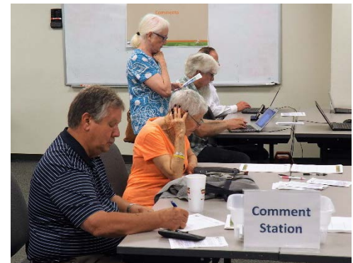
Austin Avenue Public Meeting

The official comment period was open from May 11, 2017 to May 26, 2017. Several additional recipients enrolled for email updates at the public meeting, and a public meeting follow-up statement with a reminder of the comment period was sent to 693 emails in the database on May 12, 2017. A final reminder to share input was sent to 709 email addresses on May 24, 2017.