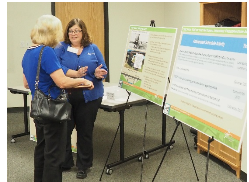
Austin Avenue Public Meeting - Section 106 Station