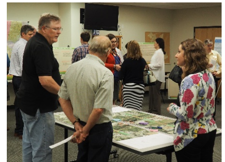
Austin Avenue Public Meeting

The City of Georgetown GCAT Building 510 W. 9th St., Georgetown, TX 78626