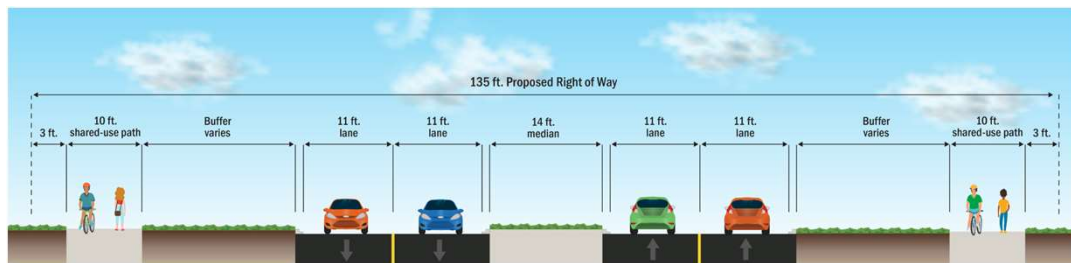
SH 29 Improvements | Haven Lane to Patriot Way

Improvements to SH 29 include constructing an additional lane in each direction, constructing a raised median and dedicated left and right turn lanes, constructing a shared-use path for pedestrians and bicyclists, and constructing a closed storm drain with curbs and gutters.